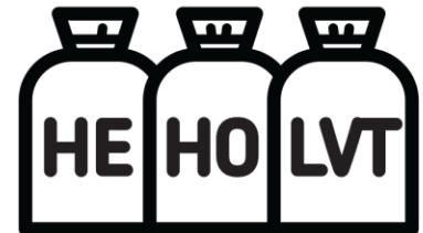
Bag offcuts in product type bags. Cut large pieces to reduce size

NO packaging, adhesive, accessories, metals, rubbish